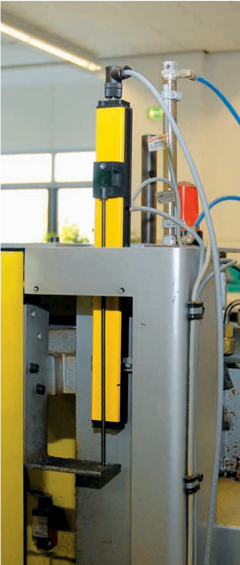
Maintenance-free: Due to their rugged housing, Turck's IP67-rated sensors are insusceptible to moisture

housing generates a high-frequency alternating magnetic field that activates the resonator integrated into the positioning device. Each time the transmitting coil stops transmitting, the resonator induces voltage into two receiving coils integrated into the sensor. The voltage intensity depends on where the positioning device overlaps the receiving coils. An integrated 16 bit processor provides a corresponding proportional output signal in different formats: 0 to 10 V, 4 to 20 mA, IO-Link or SSI.