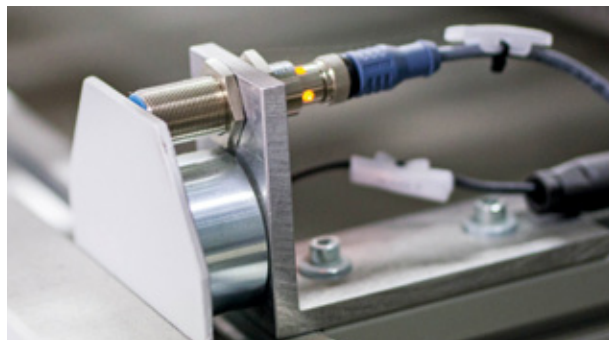
The signals of the sensor and the electromagnet are directly connected to the TBEN-S on the stacker carrier