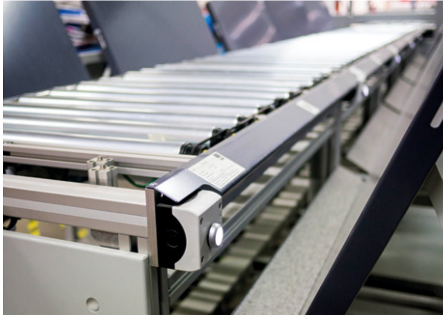
The illuminated pushbutton indicates that the cart is ready for fetching