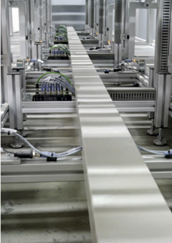
Each of the five stacker modules are provided with a TBEN-S, which connects the input and output signals of the sensors and actuators