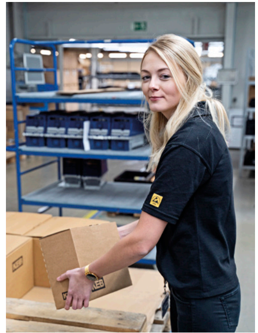
The PTL units operate at the collection points with optical detection, and just a movement of the foot underneath is needed for an acknowledgement

environment. We ultimately wanted to avoid having to maintain every change to a parts list in two databases. Thanks to their in-house expertise, KEB programmed a computer-supported user interface for touch monitors and then looked for the right pick-to-light solution with illuminated touch buttons or sensors. First results: “We definitely wanted to use bus-compatible components to reduce the installation effort at workstations with many compartments. Otherwise we would have had real bunches of cables on the shelves,” Hannesen reported. The market launch of the PTL110 series from Turck’s optoelectronics partner Banner Engineering therefore came exactly at the right time – cascadable individual devices with a multifunctional indication, optional touch button, optical sensor and alphanumeric display. The modules communicate with each other via a Modbus-compatible protocol.