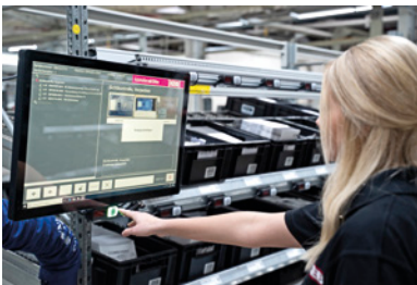
The software brings illustrated instructions onto the screen, the operation is confirmed using capacitive touch buttons

One by one: Thanks to the Modbus-compatible protocol, the PTL110 touch buttons can be cascaded easily, thus eliminating the need for labor intensive cabling