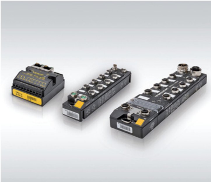
Industry 4.0 tools: Turck's I/O module series FEN20, TBEN-S and TBEN-L are not only suitable for multiprotocol operation, but can also be used as intelligent FLCs